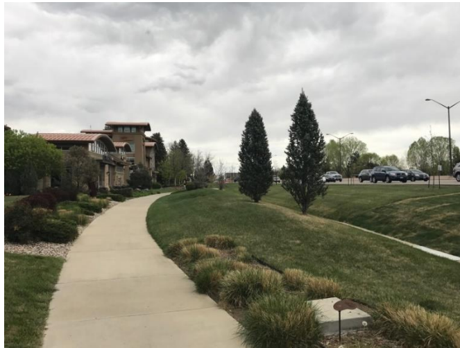
Meandering trail between Harmony Road and Buildings within landscape buffer

A 10-foot meandering trail is to be installed parallel to Harmony Road to provide connectivity and accessibility for bicyclists and pedestrians to get to the developments along with the rest of the Town.