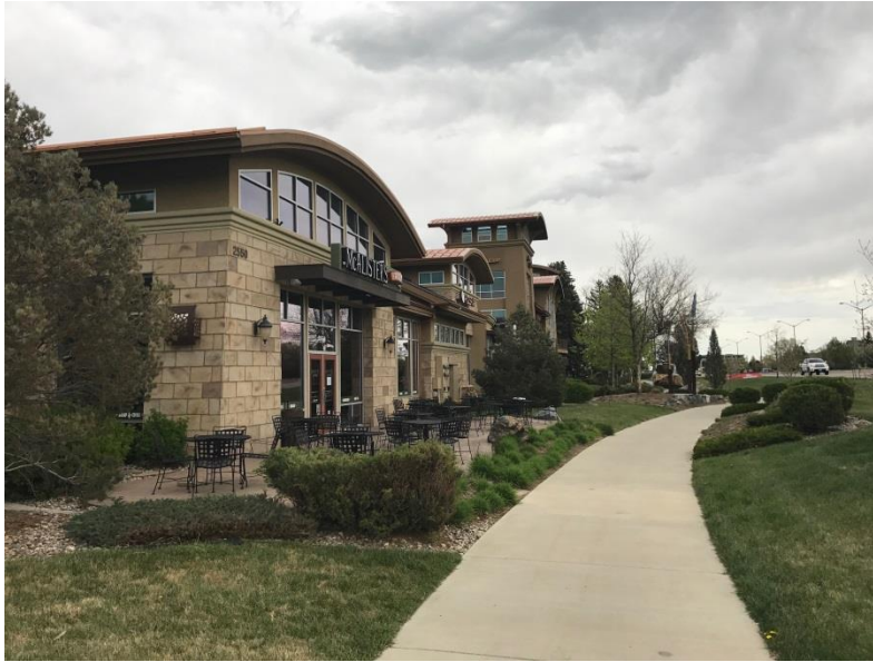
Buildings/Pad Sites set back from Harmony Road

Buildings either individual or within an inline shop shall front Harmony Road with the parking interior to the site and screened by the buildings or landscaping. Big box stores are to be set back from Harmony Road and be interior to the site to allow for pad sites along Harmony Road while sharing the parking of the other shops/pad sites in the development. There shall be designated loading areas and/or designated hours for loading and unloading of material to reduce conflict with normal business hours.