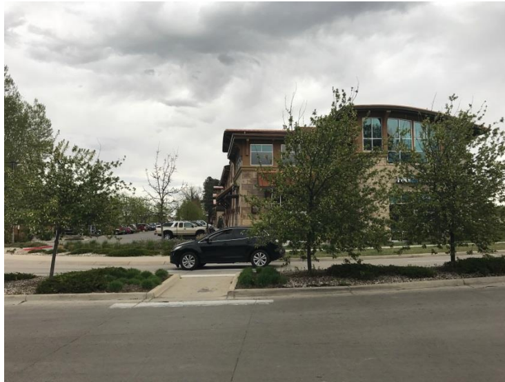
Parking behind buildings, non-visible to Harmony Road

All parking must be screened from Harmony Road to the best of its ability. Screening may be in the form of landscaping or the buildings themselves. All parking is to be set back 10 feet from the front building line adjacent to Harmony Road. Parking is to be designed as a shared area for multiple tenants and buildings. The amount of parking spaces must still meet the requirements within the Land Use Code based off of the use of each building.