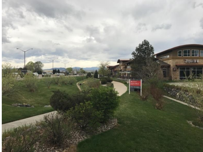
Landscape buffering between Harmony Road and Buildings